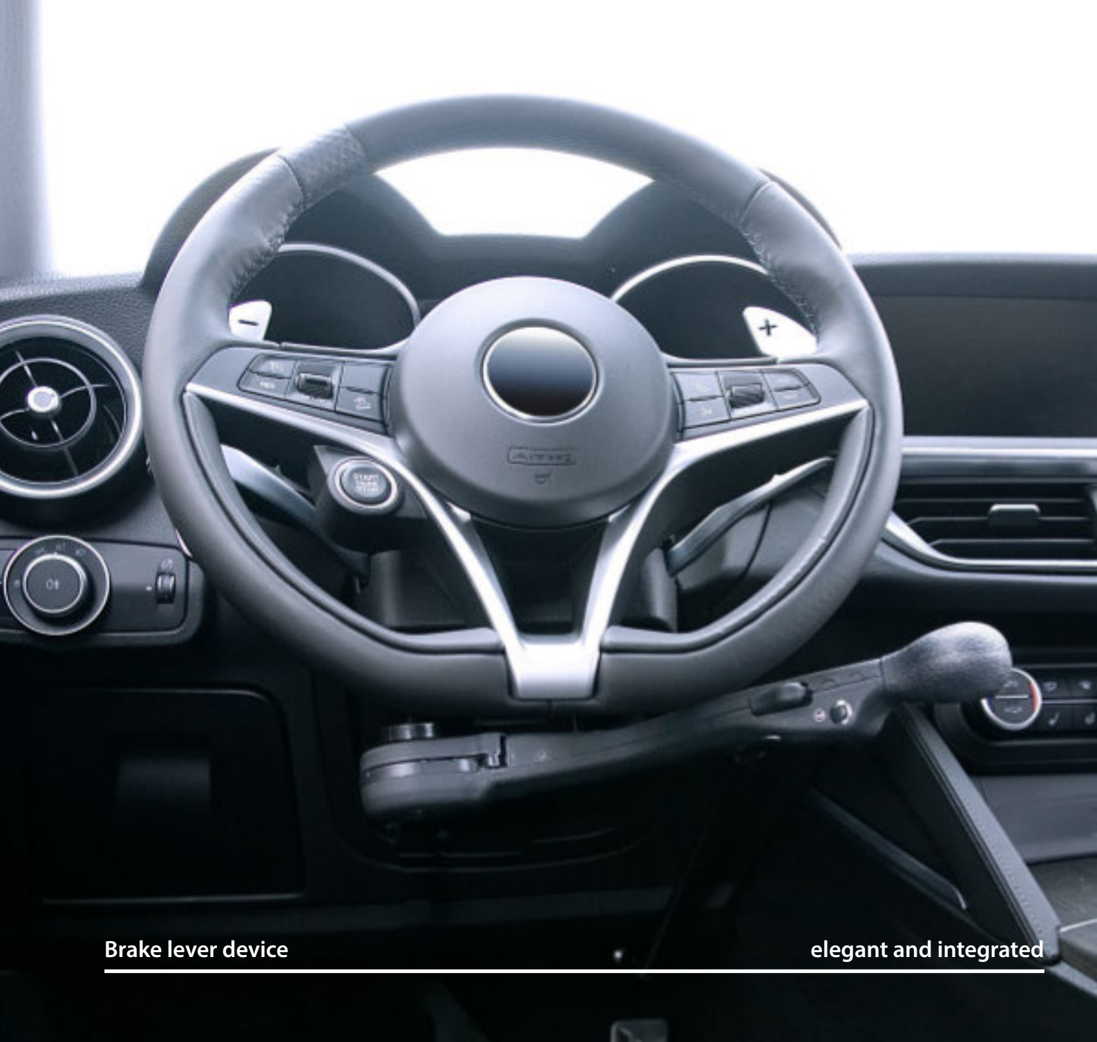
Brake lever device